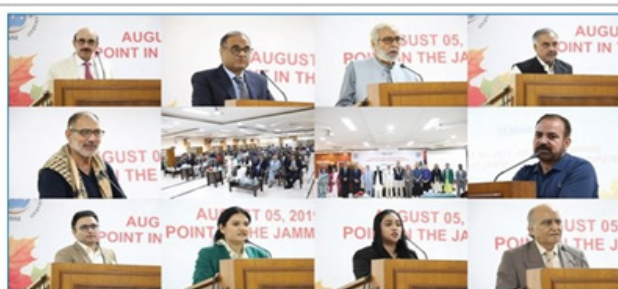
Voym-e-Istehsal Seminar Slams India's 2019 Actions, Urges Global Push for Kashmir Solution

ISLAMABAD, Aug 06 (APP): The National Assembly on Wednesday adopted a resolution reaffirming Pakistan's historic and unwavering support for the Palestinian people and their struggle for freedom, dignity and justice. The resolution, moved by PPP lawmaker Shazia Marri, expressed deep concern over the continuing and escalating Israeli military aggression in