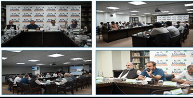
Journalists urge unified media push against India's info blockade in Kashmir